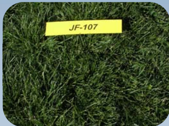
Siesta (JF-107) tall fescue

Siesta turf-type tall fescue (Experimental JF-107) Festuca arundinacea is Jacklin's newest notably fine-textured, dense, dark green variety.